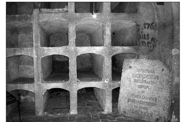
The openings for the coffins used by the parachutists to protect themselves against the murderous machine gun fire.

declared illegal. Never doing anything by halves, the Gestapo even broke open the coffins in the crypt, throwing out the bones of the priests who had been interred there over the years.