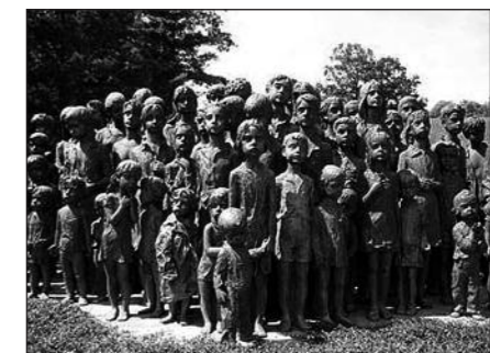
Memorial to the murdered children of Lidice.

Thousands of Czechs died as a result of Operation Anthropoid and to many the question has always been “Was it worth it?” Although it is easy to say over sixty years later, I have no doubt that it was worth it. The status of the Czech Forces and Government in Exile was certainly much enhanced as a result of the operation and from then onwards the Nazis leadership knew that they were no longer untouchable.