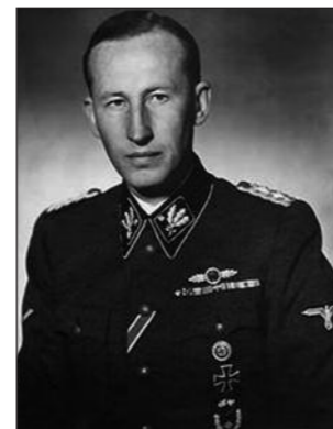
Reinhard “Hangman” Heydrich

By September 1941 Czechoslovakia had already been subjected to over two years of Nazi repression and things were