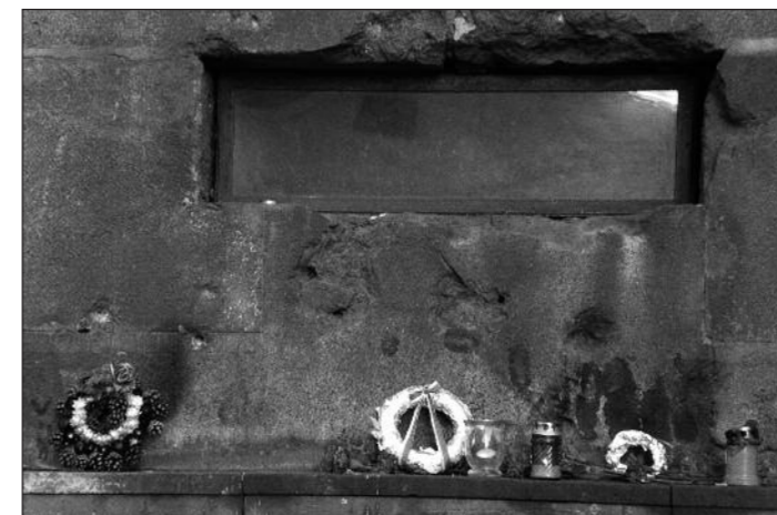
The bullet-scarred ventilation shaft into which the Nazis poured bullets, smoke and water in order to overcome the parachutists.

In reply the Nazis unleashed a reign of terror that included the destruction of the village of Lidice and later the village of Lezaky, killing all male occupants and deporting the remainder to concentration camps. The erstwhile assassins escaped and with the help of the Orthodox Church they were concealed in the Cathedral of Saints Cyril and Methodius in Resslova Street, Prague. Under the daily pressure of executions and terror, and perhaps because of the large reward offered by the Nazis, the parachutists were betrayed. On the morning of 18th June the Gestapo deployed some 800 soldiers outside the cathedral, with orders to take them alive. Three parachutists were in the nave at the time of the first assault, but managed to hold out for almost three hours before being overwhelmed and killed. The remaining four were discovered in the crypt but refused to surrender. The Nazis dynamited the crypt entrance and launched waves of attacks but the parachutists held out. The attackers then made use of a ventilation shaft in order to pour machine gun fire, smoke and finally to pump the crypt full of water, but still they held out. Finally, with the crypt filling with water and ammunition low, the parachutists had no options left. Refusing to surrender, they kept their last bullets for themselves. As I stood in the crypt, looking up at the ventilation shaft high above me, I could only wonder how they managed to hold out for so long.