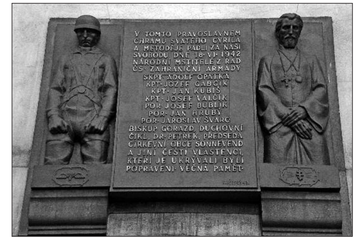
The memorial to the parachutists and Bishop Gorazd unveiled in 1947.

Still not content, the Nazis then arrested all the clergy and their families and although not involved in the event, Bishop Gorazd offered his own life in order to save the church and all those arrested. Again the Nazis were uncompromising and over the following months executed Bishop Gorazd and some 270 others including members of the clergy and congregation. The Cathedral was closed down and the Czech Orthodox Church