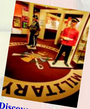
Discover a large collection of uniforms.