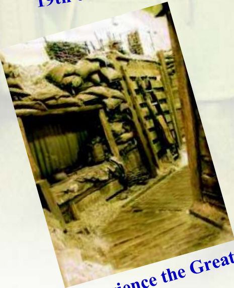
Experience the Great War Trench.

An attractive and interesting exhibition depicting the history of four famous regiments and the military connected with the County of Cheshire from 1689 to the present day. The museum contains interactive and computer displays making it well worth a visit for adults and children alike.