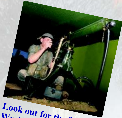
Look out for the Second World War Machine.

An attractive and interesting exhibition depicting the history of four famous regiments and the military connected with the County of Cheshire from 1689 to the present day. The museum contains interactive and computer displays making it well worth a visit for adults and children alike.