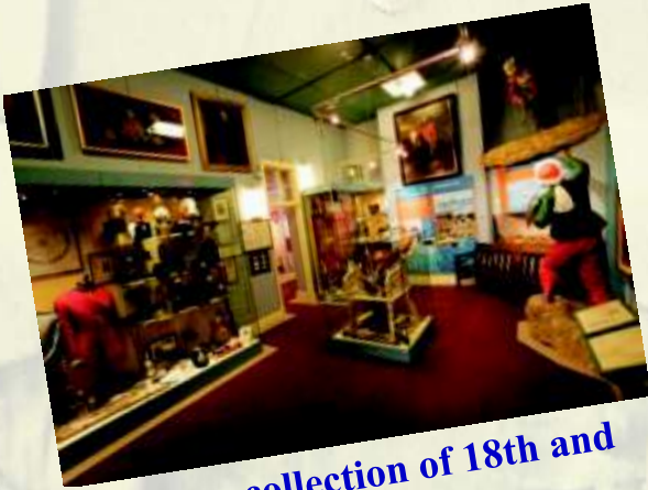
Explore a collection of 18th and 19th century artifacts.